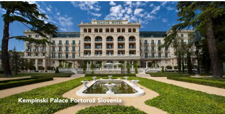
Kempinski Palace Portorož Slovenia