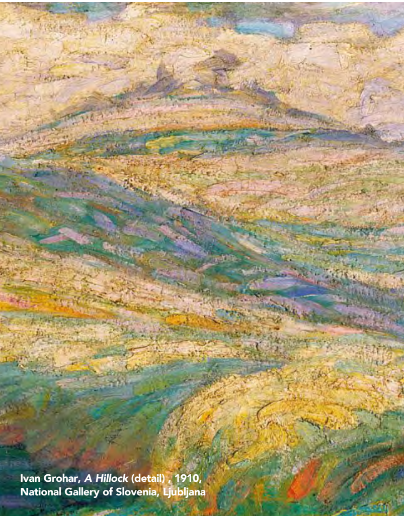
Ivan Grohar, A Hillock (detail) , 1910, National Gallery of Slovenia, Ljubljana

© 2024 Arrangements Abroad Inc. All Rights Reserved.