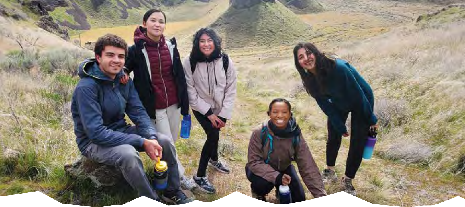
BIPOC (Black, Indigenous, People of Color) Club on a hike near Wallula Gap.